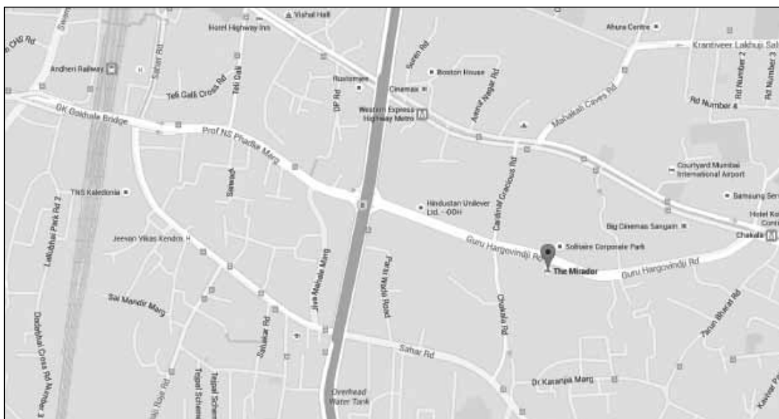
(Map not to scale)